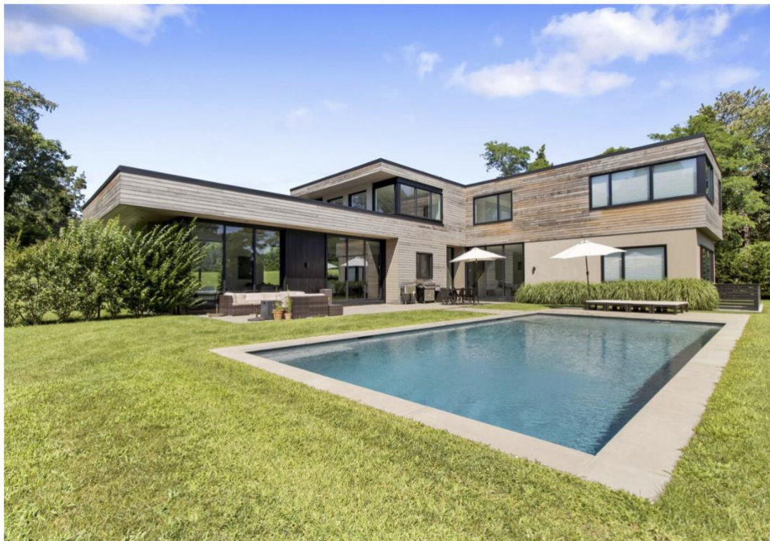
This five-bedroom house in Southampton features a pool.